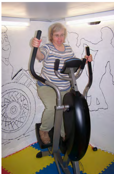
Testing out the new gym that Haldimand-Norfolk Resource Centre created from a basement storage room.

The Haldimand-Norfolk Resource Centre has created a program that has helped the whole organization become more physically active. A key component of the Get Moving, Get Fit, Enjoy Life pilot program is the training of peer specialists to provide peer leadership at the centre and to assume formal roles as activity buddies.