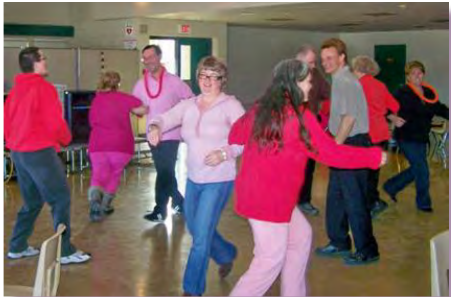
The Get Moving, Get Fit, Enjoy Life group dances to stay active.