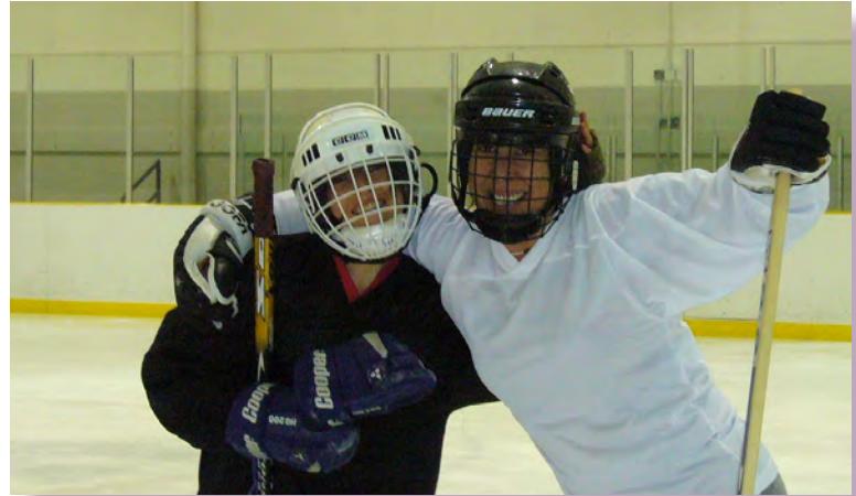
Hockey buddies... Two Gerstein Centre participants get on the ice.

Visit www.mindingourbodies.ca for details.