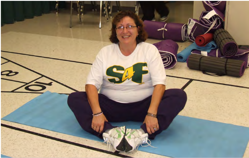
Search for Fitness members earned incentive gear through participation.