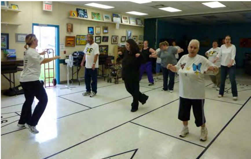
Search for Fitness aerobics class.

The program used an incentive-based approach to motivate people, first to join and then to work towards personal goals. All new participants received a free pair of running shoes and a physical activity and nutrition binder. As individuals came to classes and participated in the program, they reached new incentive levels that included items such as Active 2010 products (shirts, water bottles, pedometers and more), a T-shirt or a gym bag.