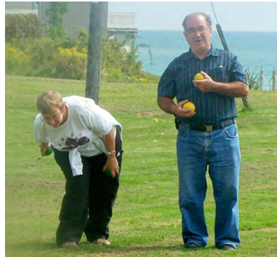
Participants of Haldimand-Norfolk Resource Centre's Get Moving, Get Fit, Enjoy Life program.