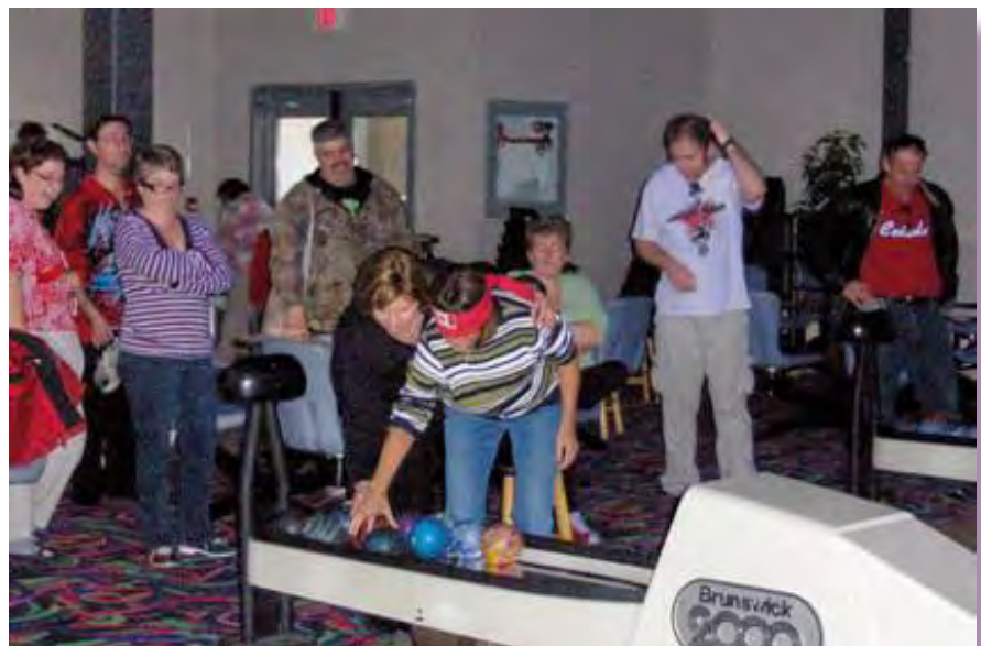
Strike!...The Get Moving, Get Fit, Enjoy Life team take bowling lessons.

A key component of the Get Moving, Get Fit, Enjoy Life program is the training of peer specialists to provide peer leadership at the centre and to assume formal roles as “activity buddies.”