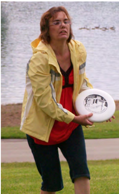
Get Moving, Get Fit, Enjoy Life participant playing Frisbee.

Activity buddies will also be matched, as required, with individuals who have an interest in connecting with existing opportunities in the community but face barriers related to their mental health, such as anxiety about meeting new people. The buddies will be trained to enable them to partner with and to mentor the individual to bridge them into community activities. The activity buddy will help participants pursue their interests, support their ongoing participation, and motivate and encourage them.